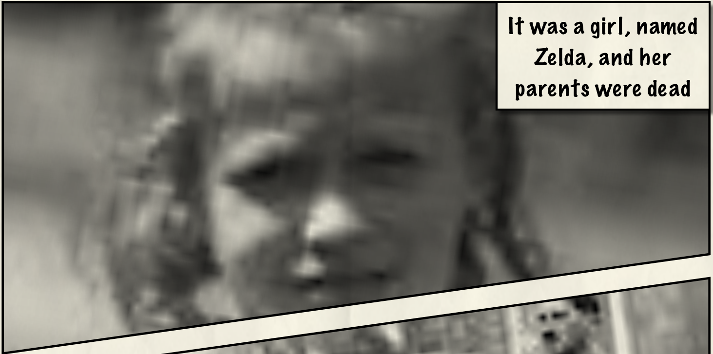
It was a girl, named Zelda, and her parents were dead