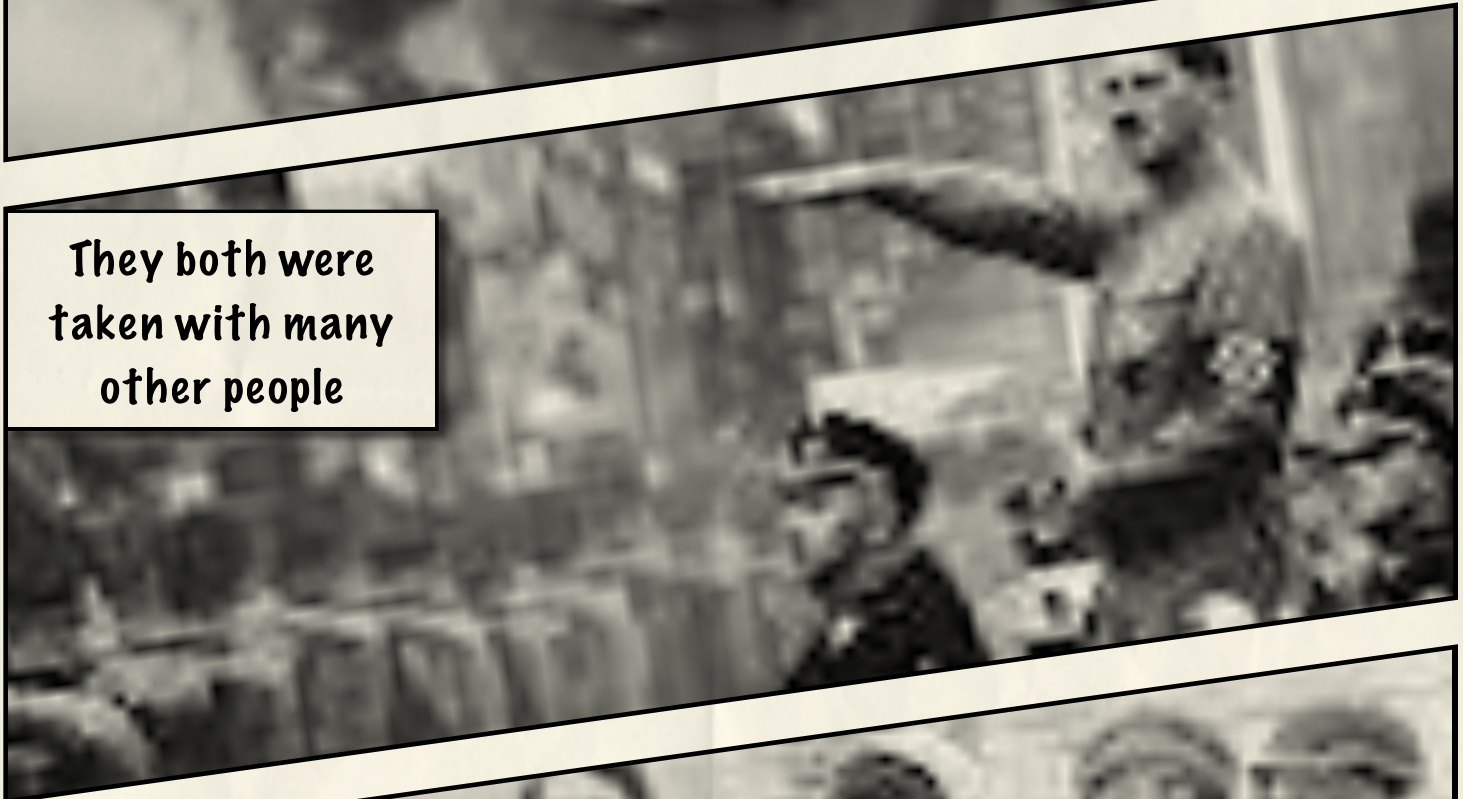
They both were taken with many other people